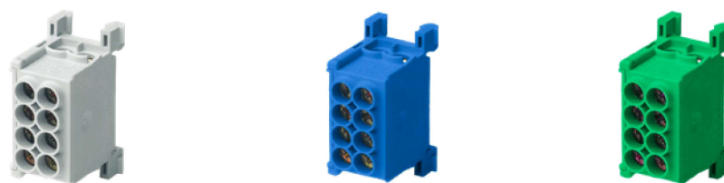
MAG 25-2 grey

rails. Contacts are made of MS 58, contact screws are made of zinc-plated steel. IP protection class for MAG 25 terminals is IP20.